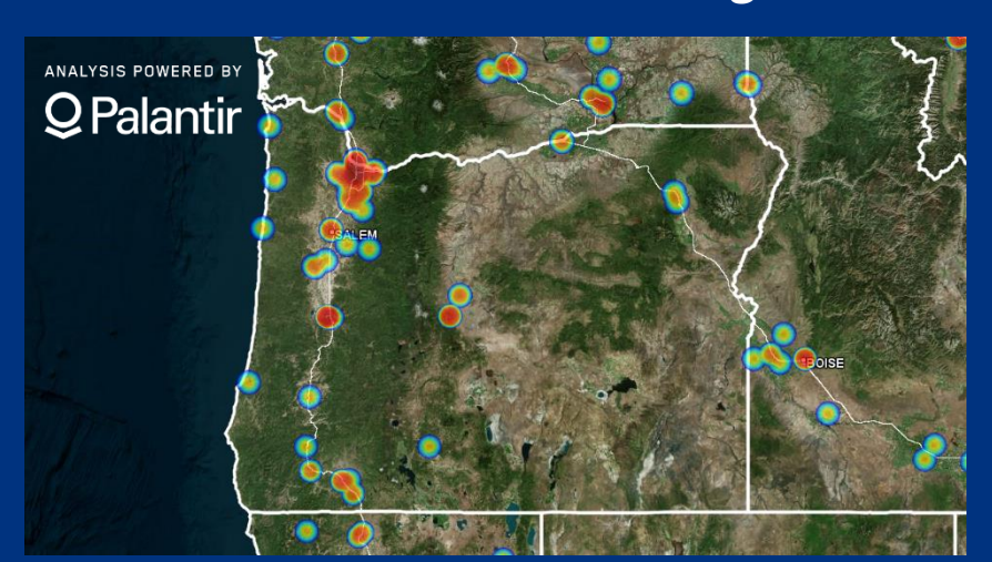
<sup>1</sup>Some cases may involve multiple locations.